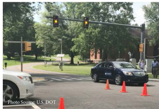
A Tampa vehicle receives an intersection movement assist warning being triggered by a New York City vehicle

Over the course of four days in the summer of 2018, a watershed moment in the maturation of connected vehicle technologies occurred at the Turner-Fairbank Highway Research Center (TFHRC), a federally owned and operated national research facility in McLean, Virginia. Through a collaborative effort, the U.S. Department of Transportation (U.S. DOT) and the three Connected Vehicle Pilot sites conducted an interoperability test to demonstrate whether a vehicle with an onboard device from one site was able to receive messages from the onboard unit (OBU) and roadside units (RSUs) of another site in accordance with the key connected vehicle interfaces and standards. A test of this nature and scope, involving three deployment sites and six device vendors, had never been done before.