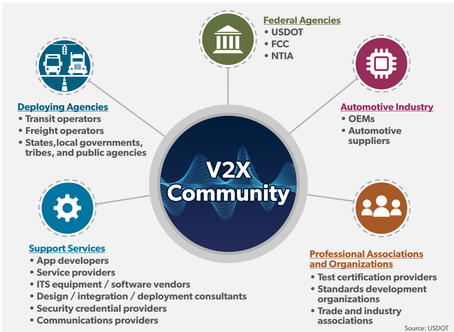
Figure 4. V2X Community Stakeholder Groups

Table 5 shows potential actions for major stakeholder groups.