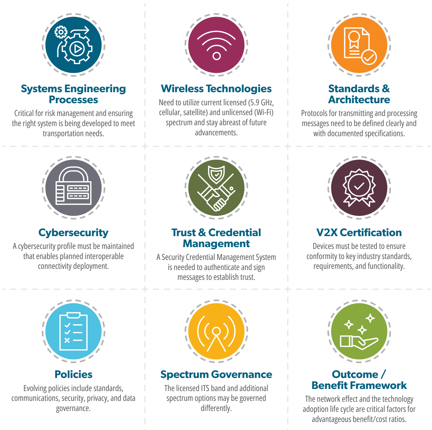
Figure 3. Key Focus Areas Enabling Interoperable V2X Deployments

Figure 3 illustrates key focus areas that enable successful interoperable and cybersecure V2X deployments. More details will be provided in a forthcoming technical appendix.